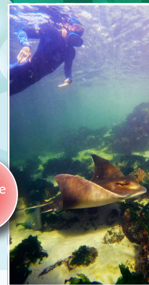
Stingray Snorkel - Fingill Lagoon ages 12+