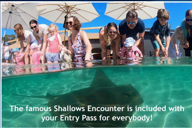
The famous Shallows Encounter is included with your Entry Pass for everybody!

Paddle in the lagoons edge, dry in your own clothes with bare feet or 'Wear & keep Souvenir Socks'